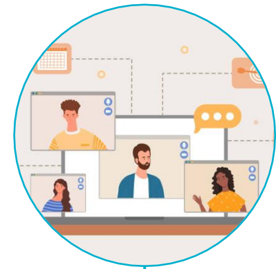
European Bauhaus Courses (EBC)